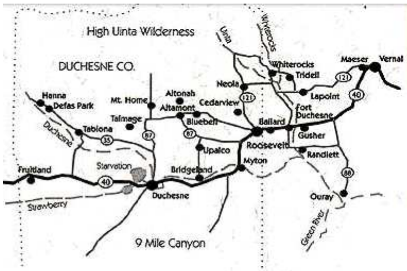
The Uintah Basin