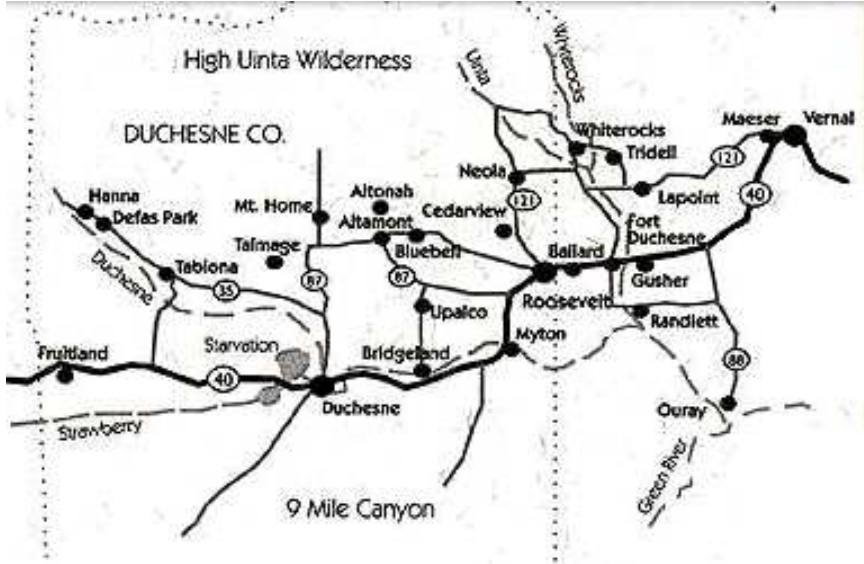
The Uintah Basin